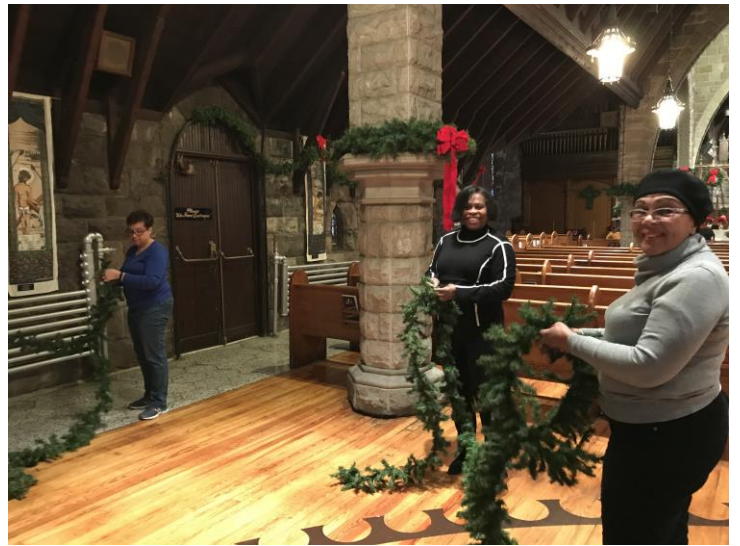
Greening of the Church on December 16, getting ready for the Pageant, and scenes from our Pageant on December 17.