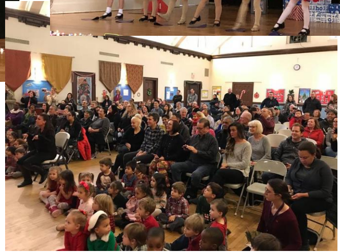
Our Nursery School Dance, Yoga, and Holiday Shows, and our Parish Christmas Party after Lessons and Carols